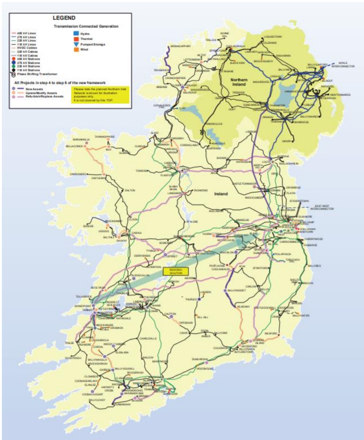
Figure 3 – EirGrid transmission network

The RSES contains a number of Regional Policy Objectives that support the transmission network improvements and facilitation of renewable energy development in the Region. These are RPO 4.16 to RPO 4.22 and RPO 8.1 to RPO 8.4